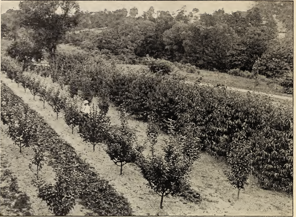
A Suburban Fruit-Garden